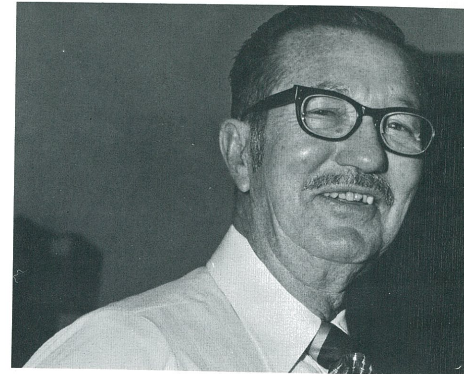
The ham of K.H.S.